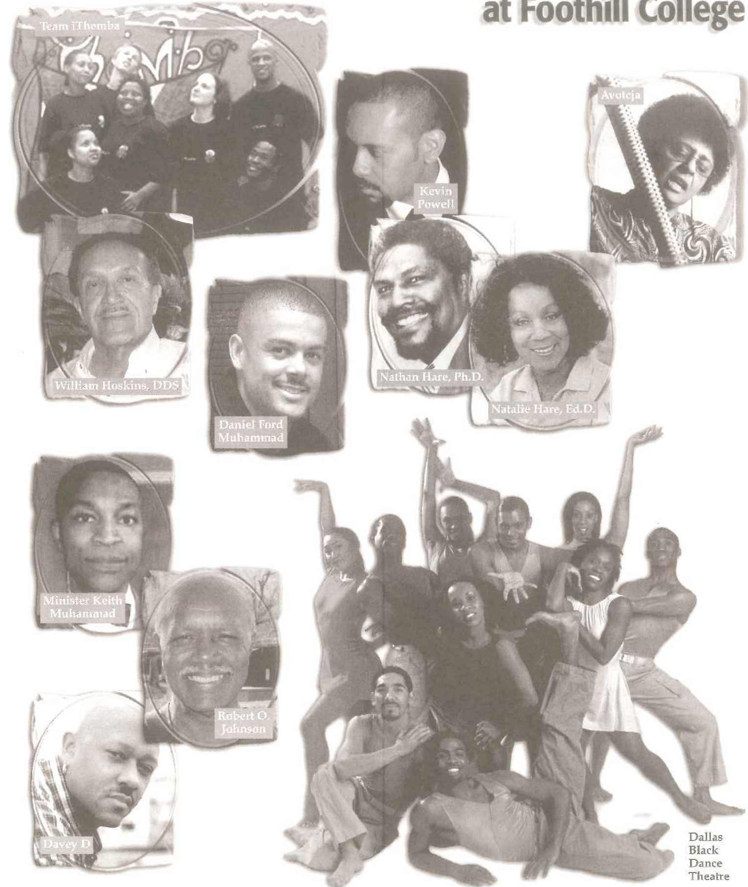
Dallas Black Dance Theatre